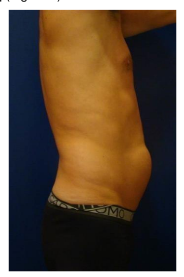
Figure 6: 44 years-old patient who underwent cryolipolysis six months ago in another medical center. Presented complication, pain, prolonged dysesthesia, induration, prolonged fatty tissue, and paradoxical hyperplasia that required surgical resolution.

invasive fatty tissue removal. However, some of them still have complications or adverse and secondary effects [15,16,17,18] (Figure 6).