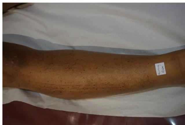
Figure 1(c): Right leg pretreatment photography. The white spots near knees were previous test with the Q-switched Nd:YAG picosecond domain lasers before start treatment.