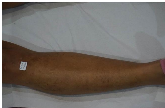
Figure 1(d): After 5 sessions Q-switched Nd:YAG picosecond domain lasers it obtained a complete reduction of the pigmented lesion.

Pain during treatment was well-tolerated with the cold air supply only. No side effects or complications were noted. After 1 year of follow up since the last treatment session in June 2019, no relapse of the NS was observed. The patient rated the results as excellent, exceeding expectations she had before starting the treatment.