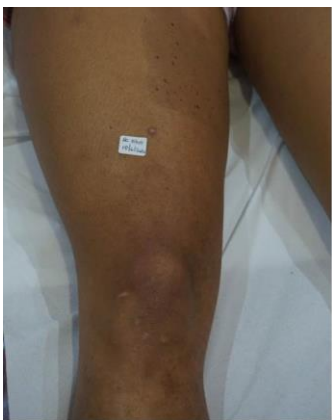
Figure 1(b): After 5 sessions Q-switched Nd:YAG picosecond domain lasers it obtained a complete reduction of the pigmented lesion. In agreement with the patient the upper part of the spilus nevus was keeping without treatment as a control area.