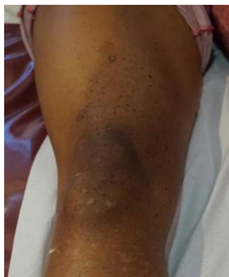
Figure 1(a): 27 years old female with giant spilus nevus on right lower extremity. Right thigh pretreatment photography. The white spots near knees were previous test with the Q-switched Nd:YAG picosecond domain lasers before start treatment.

After five sessions of laser treatment, a complete reduction of the café au lait and dark spots of the treated area was obtained (Figure 1).